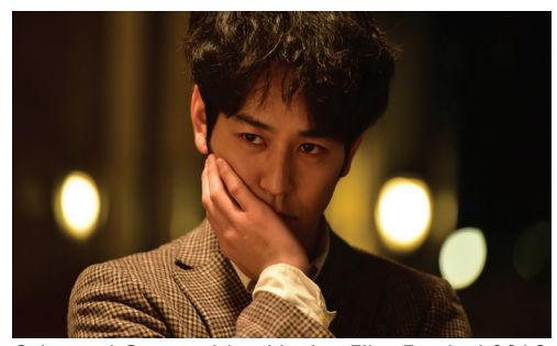
Orizzonti Competition Venice Film Festival 2016